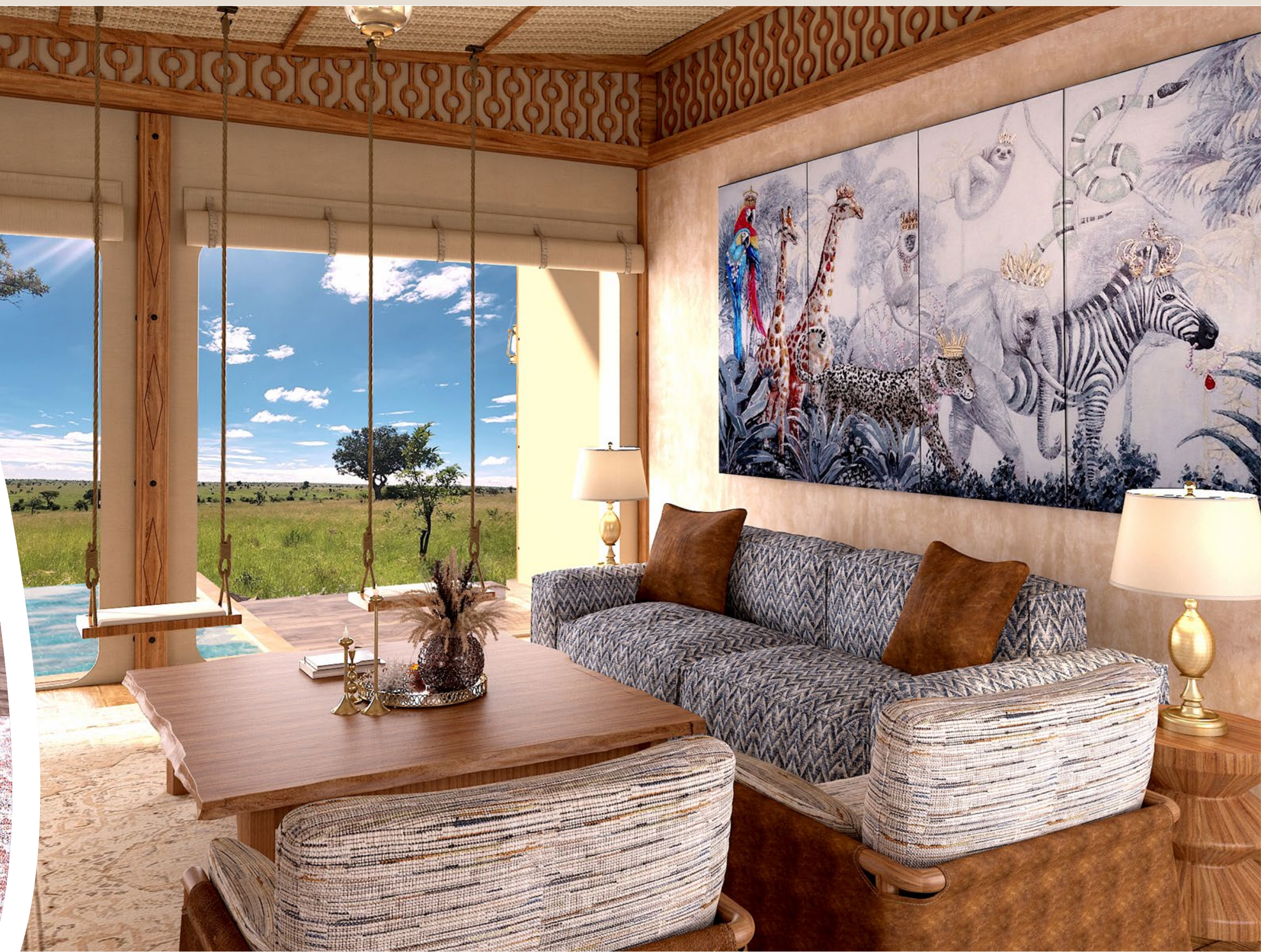
Two Bedroom Presidential Family Villa