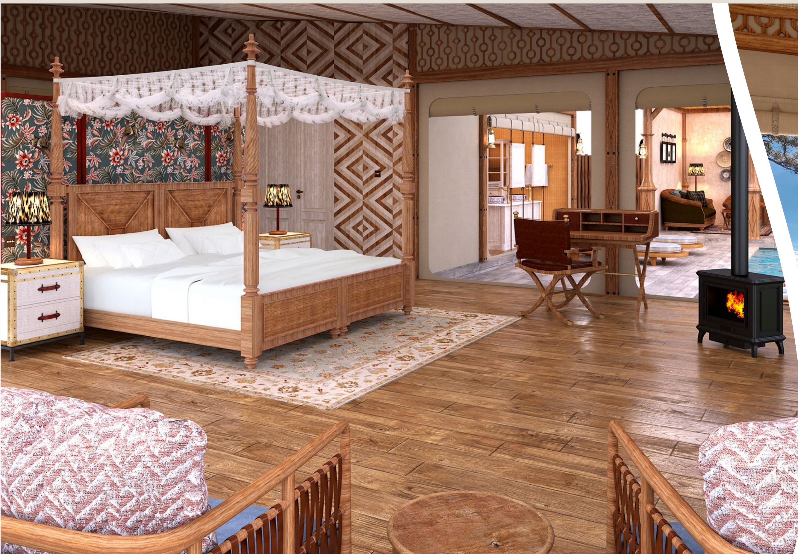
One Bedroom Luxury Villa