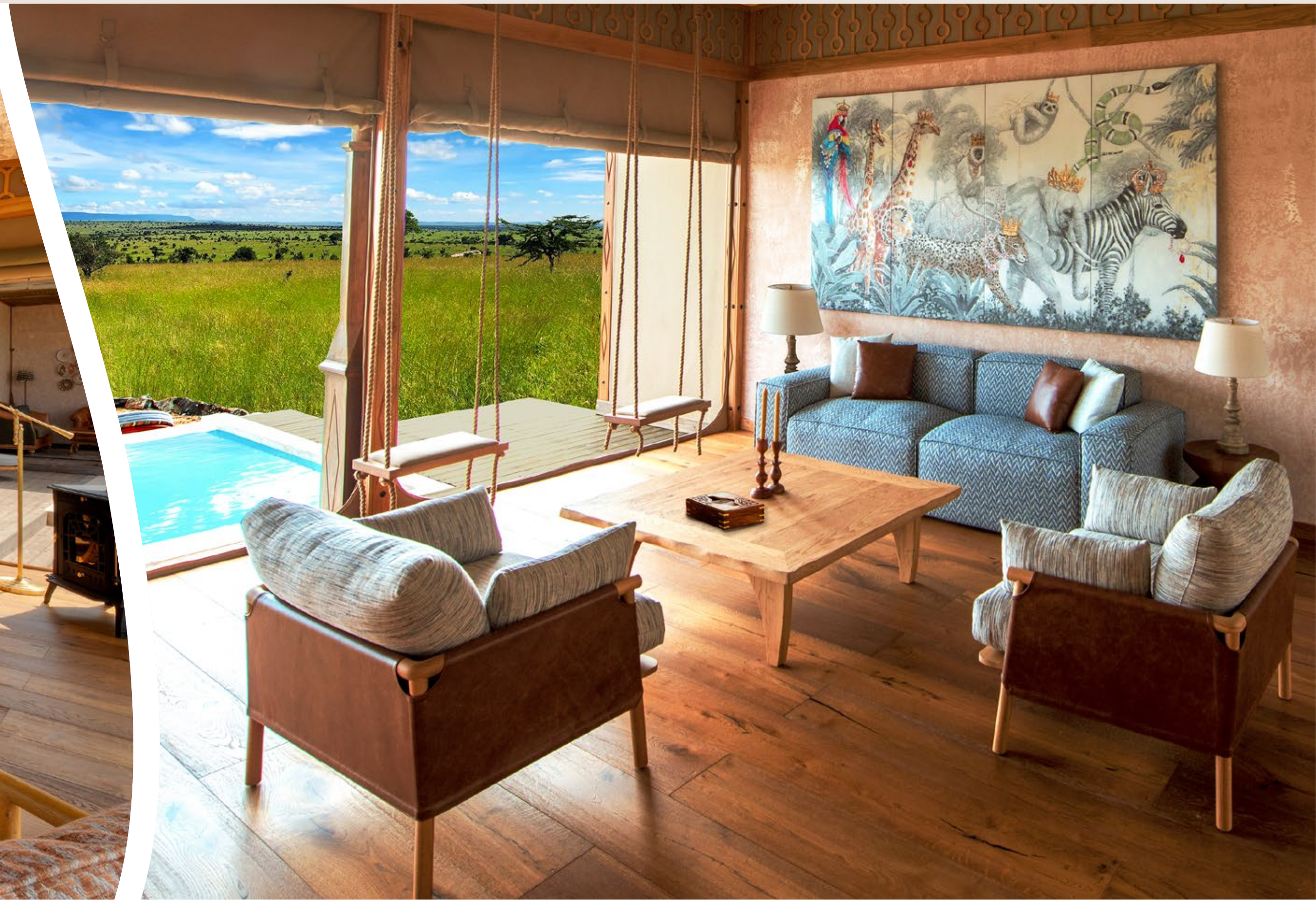
Two Bedroom Presidential Family Villa