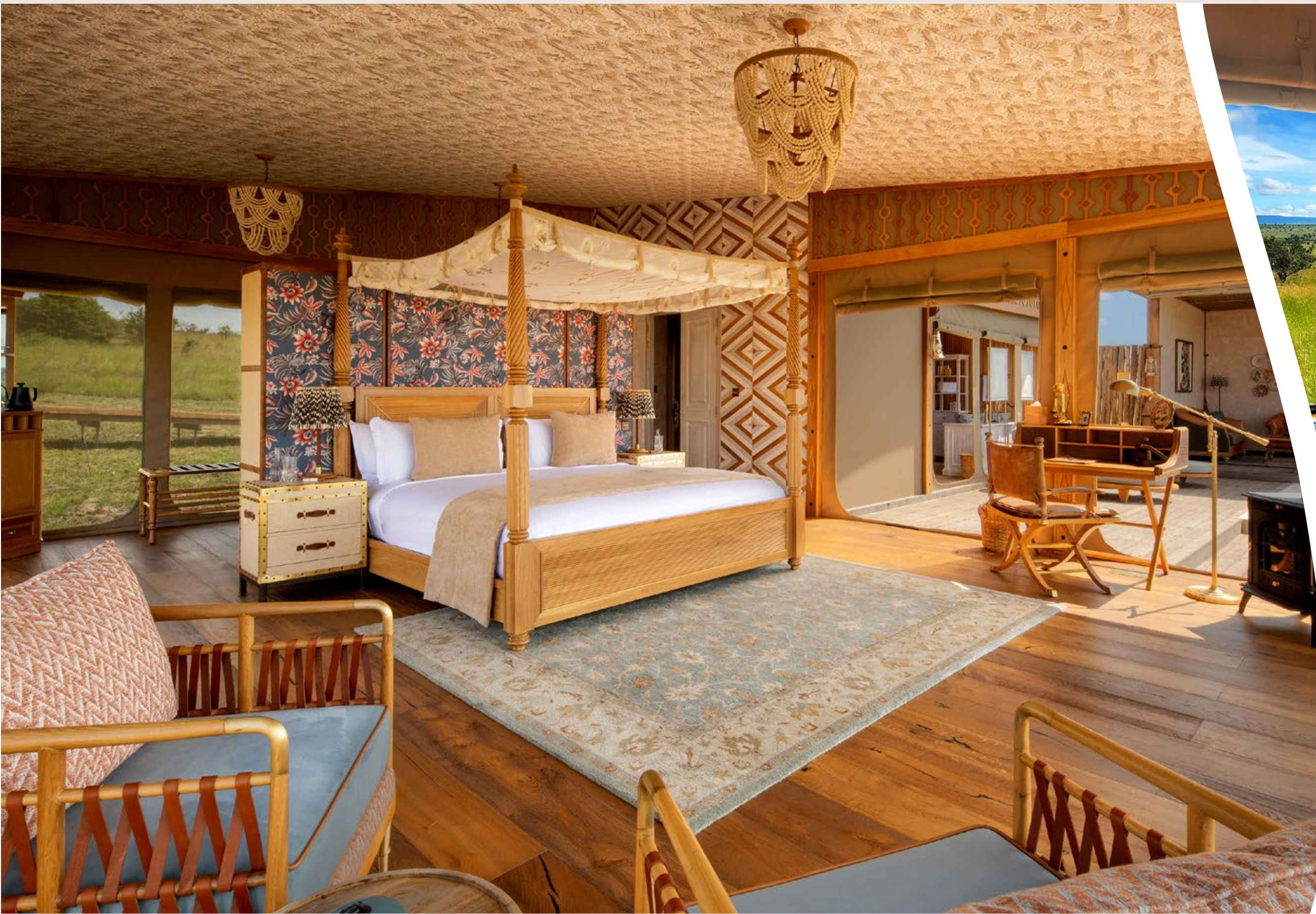
One Bedroom Luxury Villa